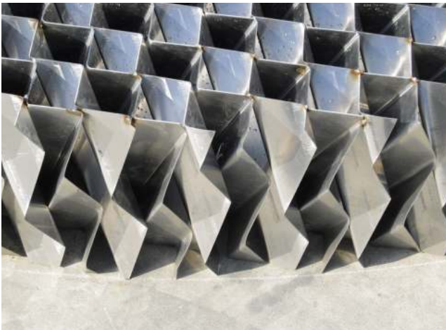
B - 64 Structured Grid for Severe Services

Any other type of Market Equivalent Rings are available on request