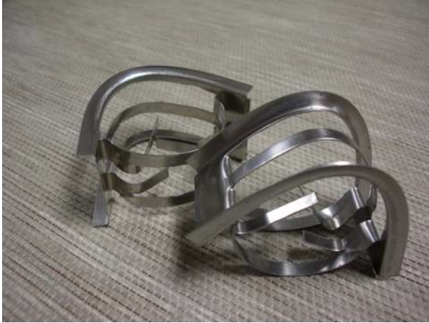
Baretti Metal Random Packing - BMRP